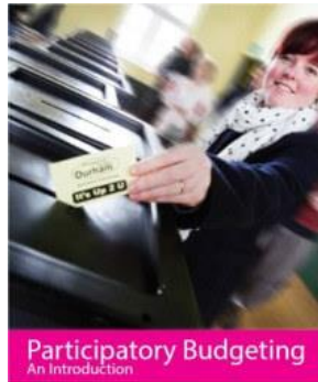
Introduction to PB