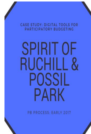
Digital case studies