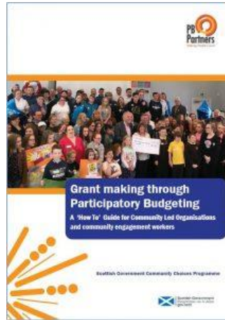
PB Small grants